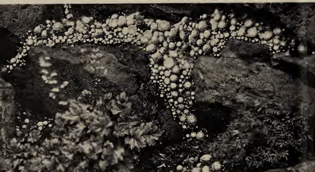
Sempervivum Arachnoideum tomentosum (Syn. Laggerii).

* BRODIAEAS in little groups of 3 to 6 bulbs, add a most delightful late spring effect to the rock garden. See under bulbs, page 4.